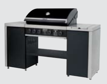
GT Island Black Enamel