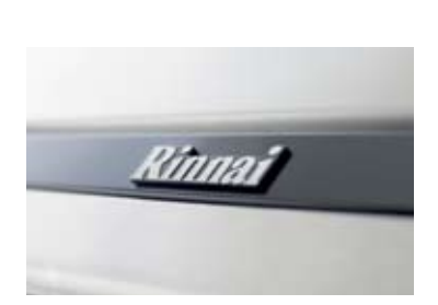
304 Commercial Grade Stainless Steel