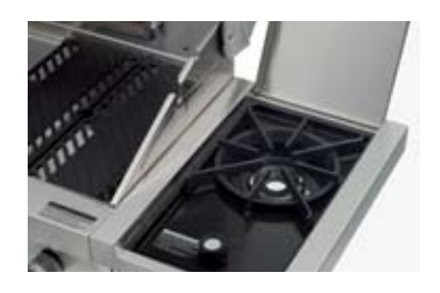
Side Burners with Cast Iron Trivets