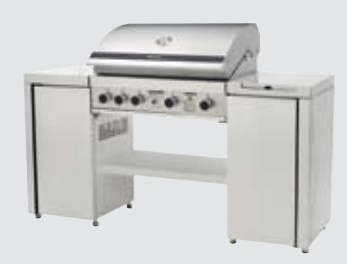
GT Island Stainless Steel