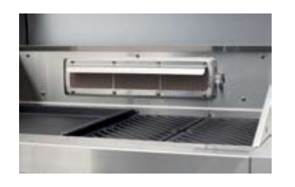
Back Burners For the perfect roast Rotisserie kit available separately