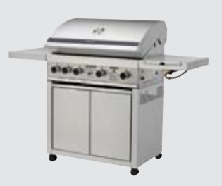
GT Trolley Stainless Steel