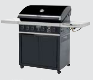
GT Trolley Black Enamel